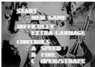
Fig.2 Menu Screen